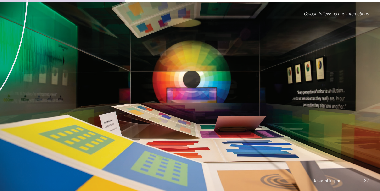
Colour: Inflexions and Interactions

On display at Main Library, Level 3 and 5, and Paddington Library until March 2025, this display of books and other printed matter charts our understanding of colour and light from Sir Isaac Newton's prism experiments in Opticks; or, A treatise of the reflexions, refractions, inflexions and colours of light (1704) to modernist studies in colour theory epitomised in Interaction of color (1963) by Josef Albers.