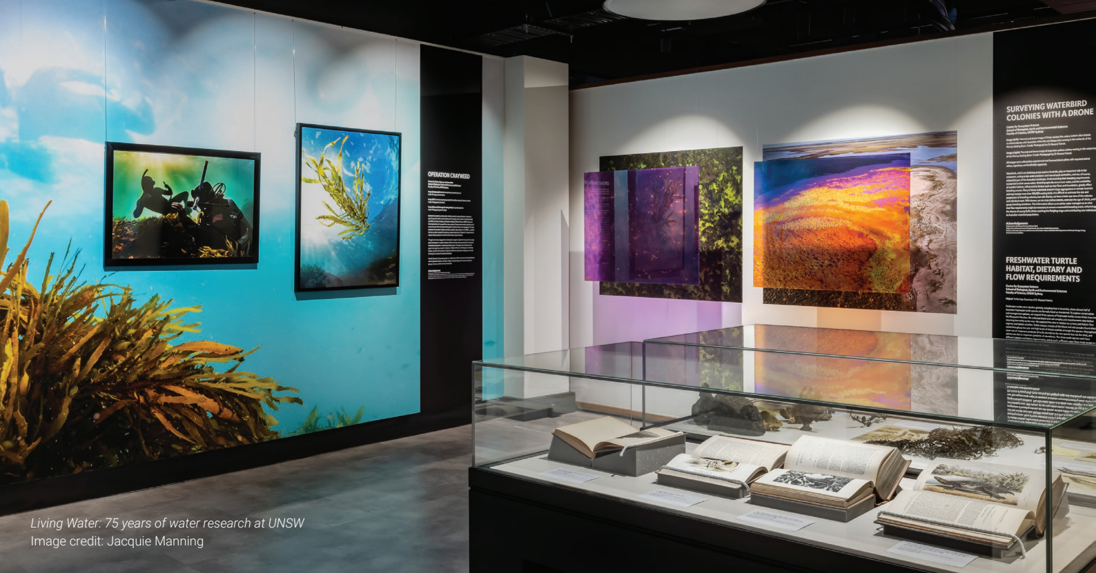
Living Water: 75 years of water research at UNSW